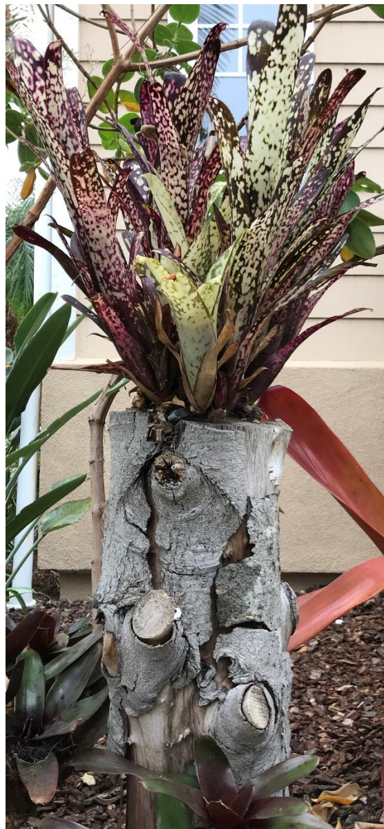
Billbergia 'Hallelujah' and 'Mariposa' sharing space on a log.

I look forward to seeing many of you this weekend. Some of you I will be seeing Saturday, since Bird Rock Tropicals is having their big holiday