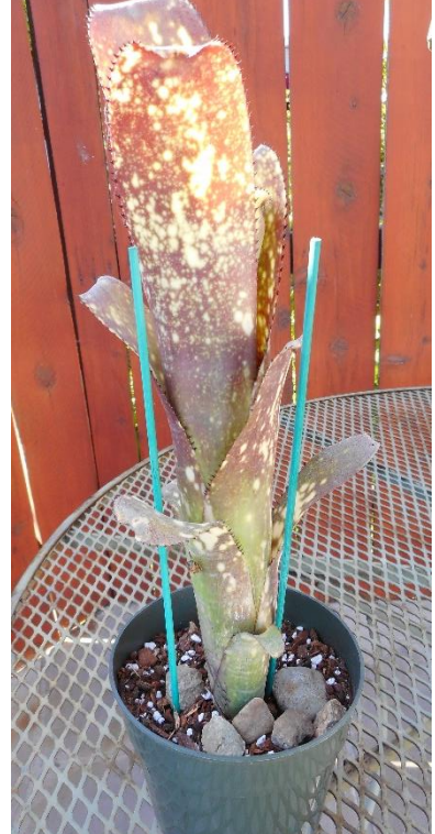
Auction plants for the April meeting: Tillandsia 'Super Steve', top left; Billbergia 'Spots and Dots', left; Tillandsia roezlii, lower left.

as to hotel reservations, rates, and speakers.