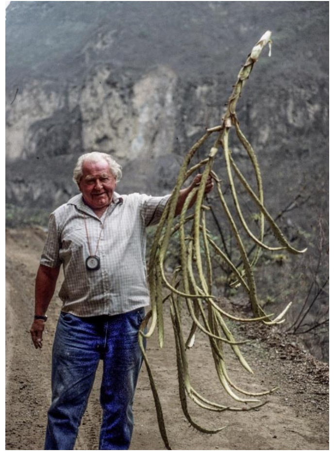
Rauh with Tillandsia rauhii v. longispica

store the heterogeneous information found in these field books, as well as to link the information to actual