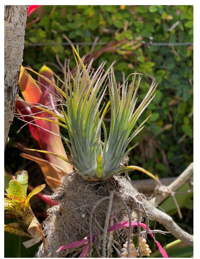
Tillandsia fasciculata x ionantha.

Now that we've been having some warmer weather, don't forget to dump out and replenish the water of