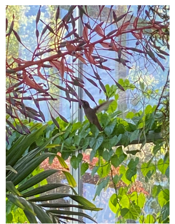
Hummingbird stopped by for a snack on Portea petropolitana var. extensa. World of Bromeliads show opening night.

Happy September everyone. Can you believe it's almost fall already? Where did the summer go? Hopefully we will have some rain during the upcoming months. Everything is so dry around here. I will say that some of the bromeliads have been putting on quite a display with their vivid colors and blooms. Speaking of displays, did you get a chance to see the bromeliad exhibit at the San Diego Botanic Garden? It's well worth a trip. Thank you to the many members who loaned their plants for the show. There is still time to view it between now and Sept. 26th when the exhibit will come to an end. You can also buy some bromeliads to add to your collection each weekend (except for this weekend) through the 26th. While you are there, take time to wander through the grounds as there are many rare and spectacular plants (including bromeliads) interspersed throughout. Don't forget to go online and reserve your ticket on the SDBG website.