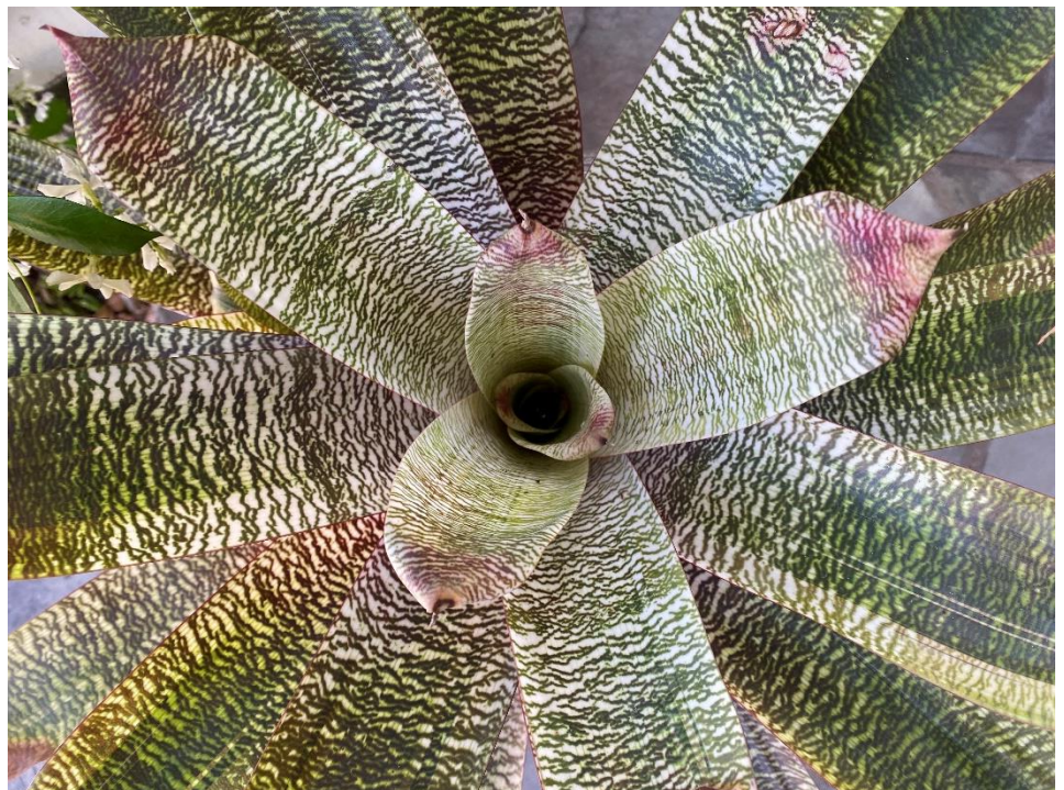
Top: A Vriesea fosteriana hybrid. Left, the Vriesea -adjacent Goudaea ospinae var. gruberi .

own Scott Sandel, the article has photos from Morlane's garden and Scott's own collection. You'll see lots of eye candy photos in addition to text on San Diego cultural tips, propagation notes, and plant sources.