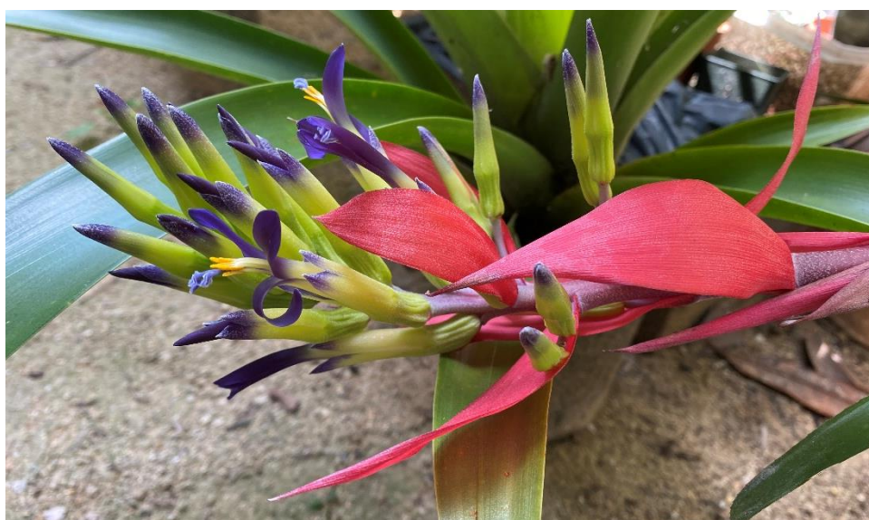
Billbergias are blooming now.