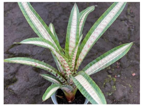
Top right: Rarely offered for sale, this Vriesea 'Galaxy' is the variegated cultivar of Vriesea glutinosa . To complement the amazing foliage, this plant shoots up a multi-branched red upright inflorescence, like a Vriesea splendens on steroids! This brom will be in the live auction.