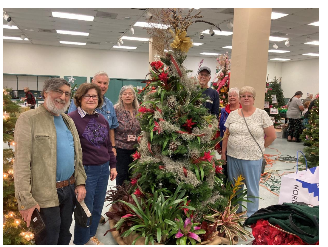
SDBS Christmas Tree team

To increase the Holiday mood please consider dressing in a festive mood. Be it ugly sweater, dressed to