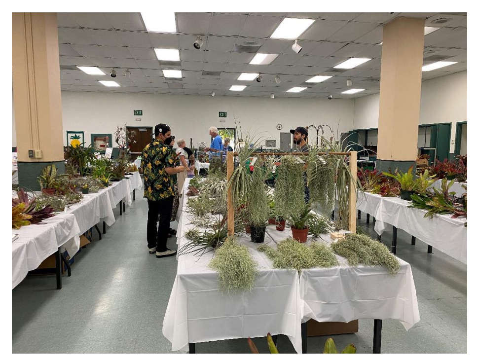
SDBS Sale, June 2022