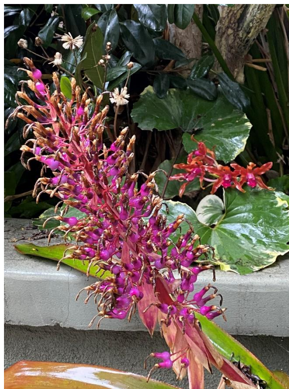
Basking in the rain: Portea candy's fruit glow as bright as the orchids behind it.

present this question to all members---please respond to me in writing---your preferred planting mixes. Please show preferences for different genera along with sources. I will report back monthly via the newsletter so we all have a documented resource to use for the future. Good gardening!