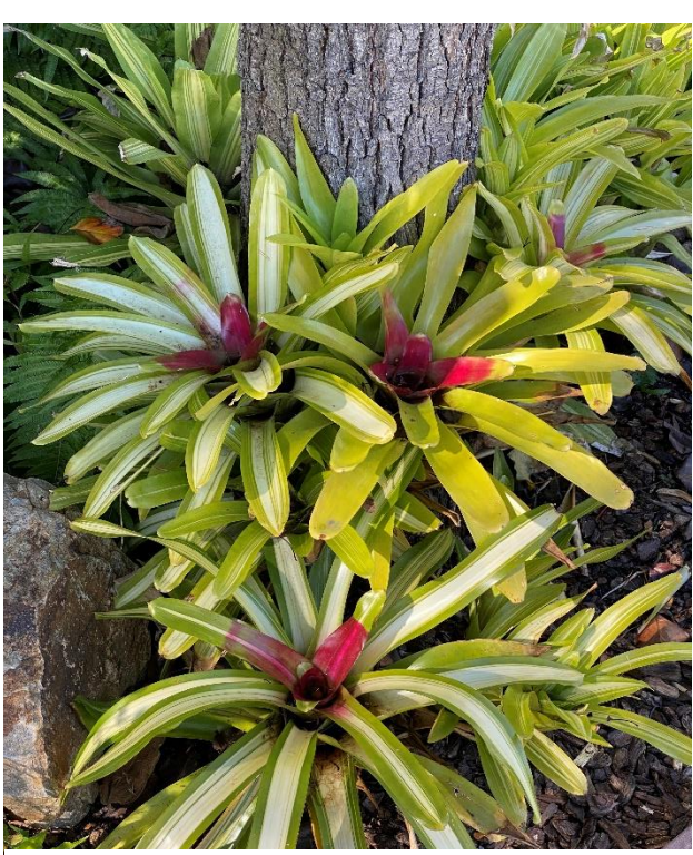
Most plants in this clump of Neo carolinae hybrid are in bloom now. I think they enjoyed the winter rains. Note how some individuals don't have the variegation.

Last month I brought up potting mixes to use. Well, most commercial and hobbyists included Peat as an ingredient. Are there more earth-friendly substitutes? "Peat comes from moorlands, peat bogs, in Canada, Europe, Africa and in the Eastern US." Removing a yard is removing 1000 years of accumulation and there is no replacing it. The UK and other governments plan to ban its sale starting in 2024. Coir - ground coconut hulls – are a possible substitute. We will be talking more on this subject in the future including pumice/dry-stall - stay tuned.