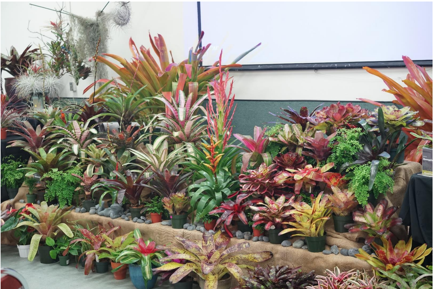
SDBS Show 2019

We need volunteers and show plants. Sign up with google sheets – links on the right.