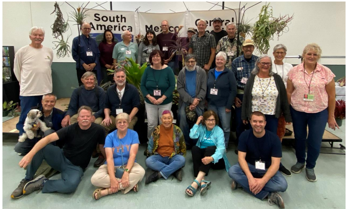
Club photo at the Show and Sale

Our Bromeliad Show and Sale in Balboa Park was a huge success for