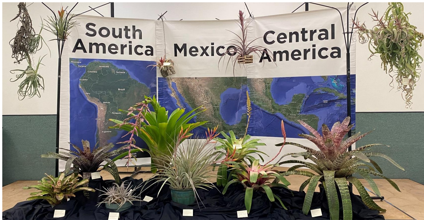
We used the cool map banners left over from the fair to create a display in the back stage, highlighting the places where bromeliads grow. The main display was set up in front of the room to maximize visual impact.