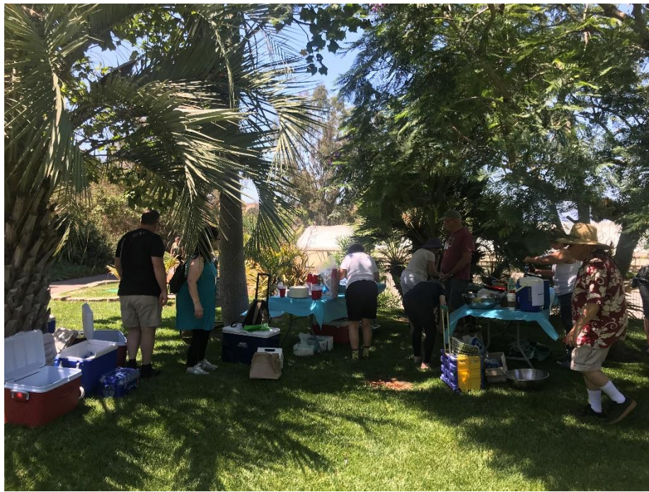
2019 picnic at Pam's

Our annual SDBS member picnic will be held at Bird Rock Tropicals in Pam's beautiful private garden behind the green houses on August 12th at 10am-3pm.